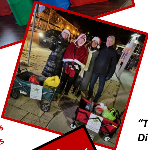
Green Bucks Christmas Store

Too many to name here...These are just a few of the individuals and groups delivering much need food and donations...but know that we are so grateful to EVERYONE!