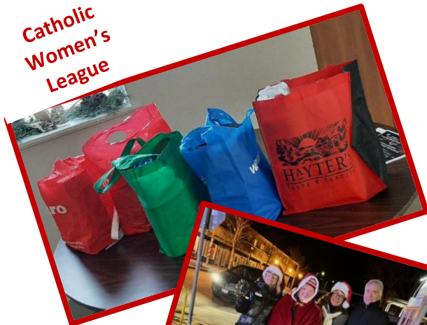
Catholic Women's League